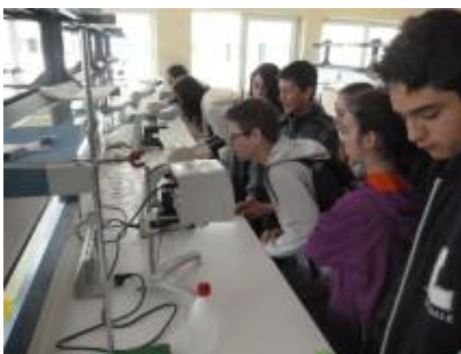
A visit to the Technical College of Karditsa, for the project, “We are what we eat”