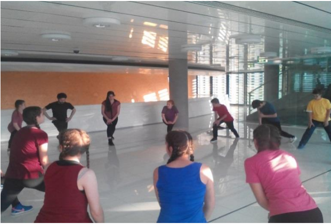
Hard work for Dancing to Connect