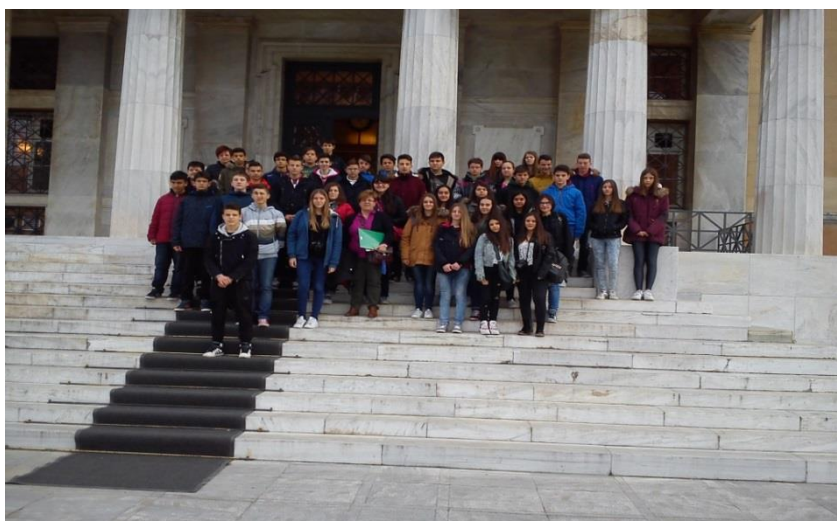
A very informative visit at the Greek Parliament