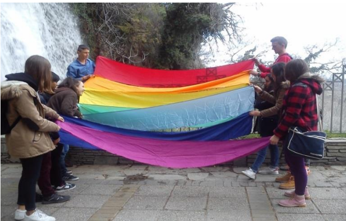
Activities during their visit to Edessa