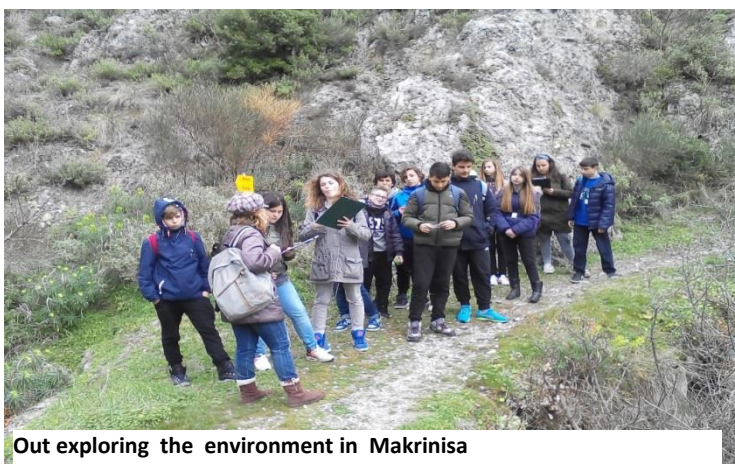
Out exploring the environment in Makrinisa