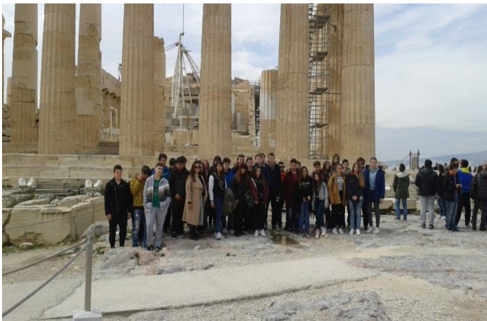
A visit to the Acropolis