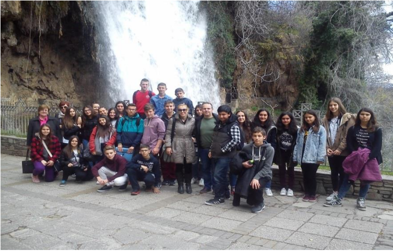
Educational trip to Edessa