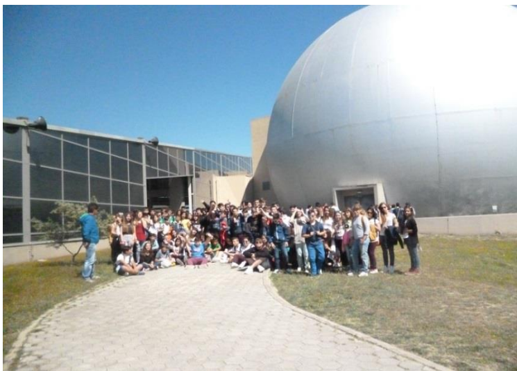
A visit to the Planetarium in Thessaloniki