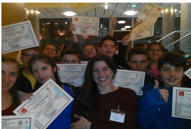
The dancers are thrilled with their awards!!!