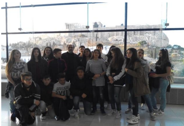
The “Dancing to Connect” group enjoying a visit at the Acropolis Museum