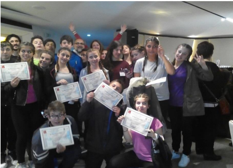
Awards from "Dancing to Connect"