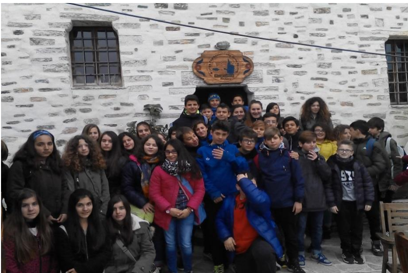
Educational visit to Makrinitza