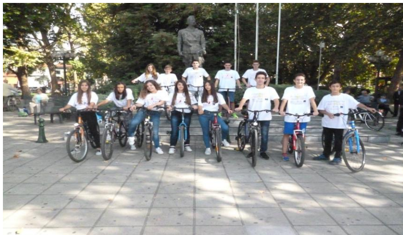
PHOTO GALLERY SPORTS MOBILITY WEEK